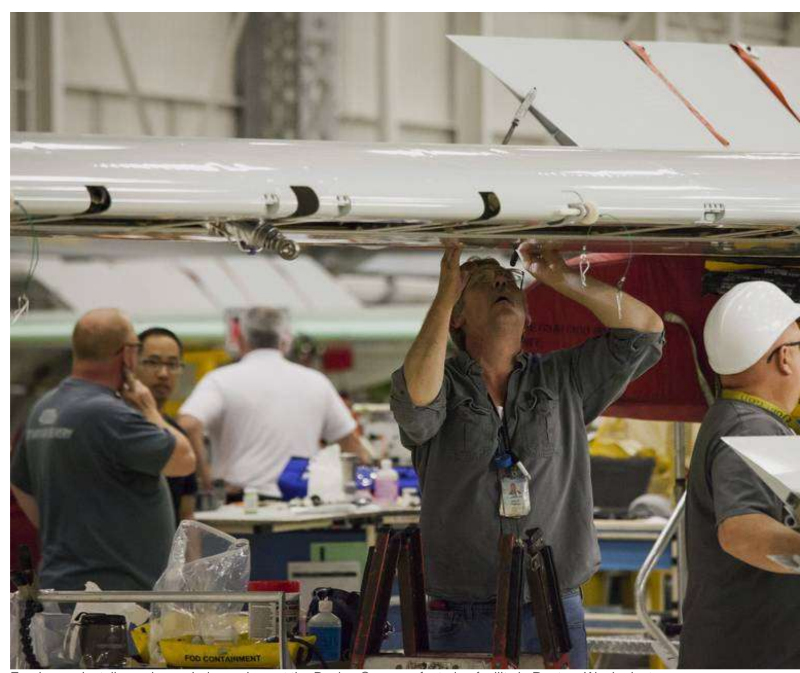
Employees install panels on airplane wings at the Boeing Co. manufacturing facility in Renton, Wash., last year.

Number of open positions highest in 15 years, with many workers not possessing skills to do today's jobs